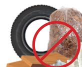
WOOD, WASTE, OR TIRES