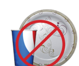
WAXY COATED PAPER ITEMS