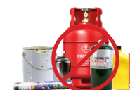
HAZARDOUS MATERIALS OR EXPLOSIVES