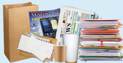
Junk Mail, Periodicals, Office Paper & Paper Cups (Paper bags & cups, envelopes, & catalogs)