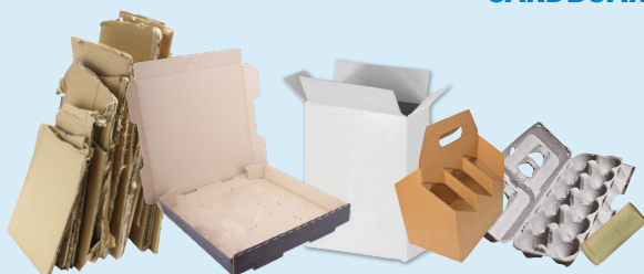
Cardboard & Boxboard (Clean & dry)