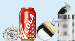
Aluminum & Steel Cans (Clean foil & empty food or beverage cans)