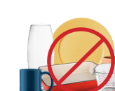
CERAMICS OR BAKING GLASS