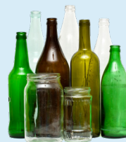
Glass Bottles & Jars (Empty food & drink containers only)