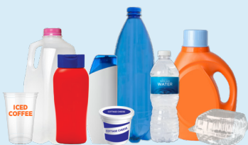
Plastic Bottles, Jugs, Tubs, & Lids (Empty kitchen, laundry & bath containers & clamshell packaging)